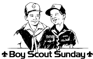
♣ Boy Scout Sunday ♣

Sunday, February 12 , is Boy Scout Sunday at Faith UMC. Faith is the sponsor and host of Boy Scout Troop 310 and Cub Scout Pack 4321. Our Scouts will be leading us in worship and should be